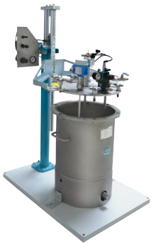
Material supply with lifter and stirring function

For optimal material handling we offer different pressure tanks in designs to meet the requirements. Please contact us!