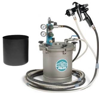
Lightweight pressure tank LDG 10 with conductive Inliner