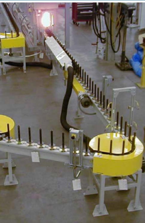
Spindle Boss Chain-on-edge